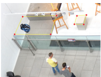
OBJECT TRACKING Track Objects Removed from or Abandoned