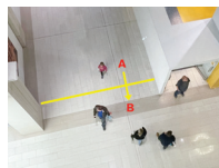
LINE CROSSING Track People or Vehicles Entering/Exiting